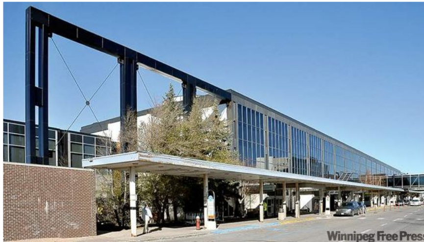
Enlarge Image

The city airport terminal opened in 1964 (above) is one of the finest pieces of Modernist architecture in Canada. It adds to the richness of Winnipeg's architectural history, as shown in the downtown buildings below. So should the old airport terminal be torn down or preserved?